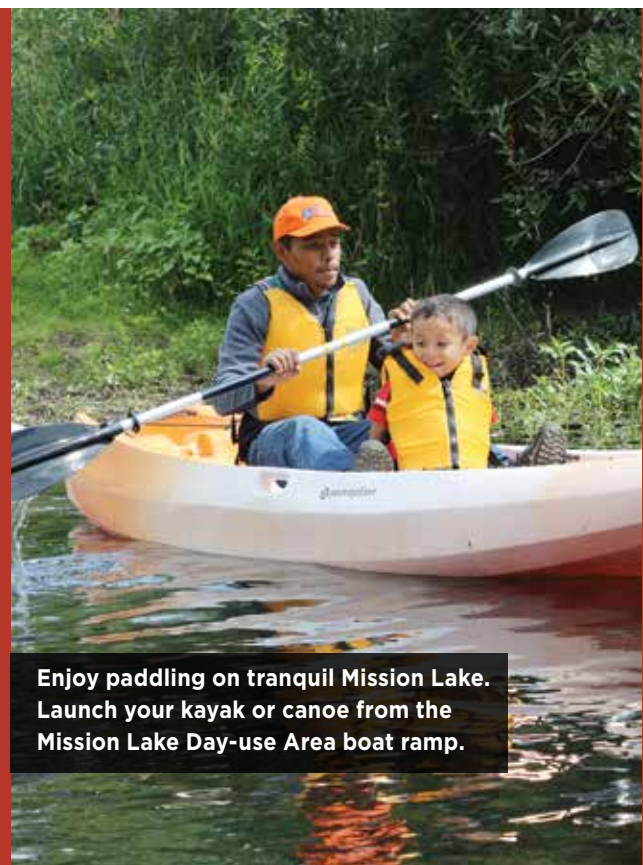
Enjoy paddling on tranquil Mission Lake. Launch your kayak or canoe from the Mission Lake Day-use Area boat ramp.