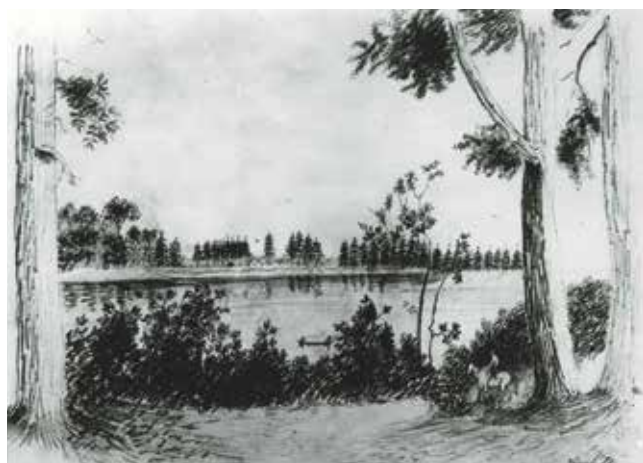
Sketched from a U.S. Navy encampment on the banks of the Willamette River circa 1841, this drawing shows the original Willamette Mission on the opposite riverbank.

Note: Trails flood during heavy rainstorms in winter and spring. Call 503-393-1172 x40 for closure information.