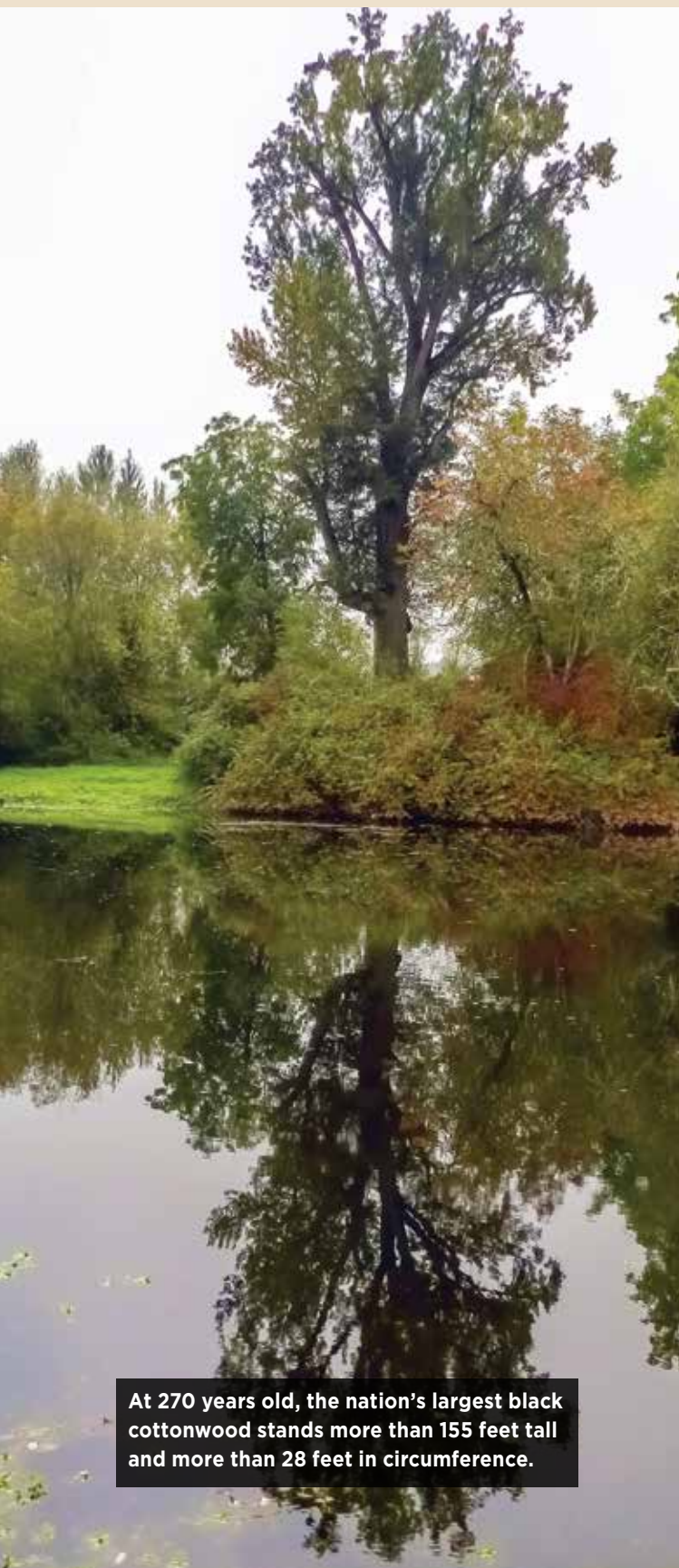
At 270 years old, the nation's largest black cottonwood stands more than 155 feet tall and more than 28 feet in circumference.