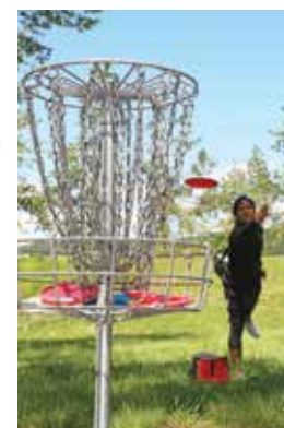
The Wheatland Disc Golf Course features 18 holes that weave through a hazelnut grove.

In summer, watch for pale pink and purple roses by the park entrance and at the Mission viewing deck. The Salem Rose Society planted these descendants of a rose brought west by the wife of the original mission's blacksmith.